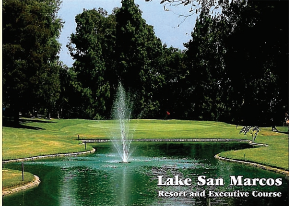
Lake San Marcos Resort and Executive Course